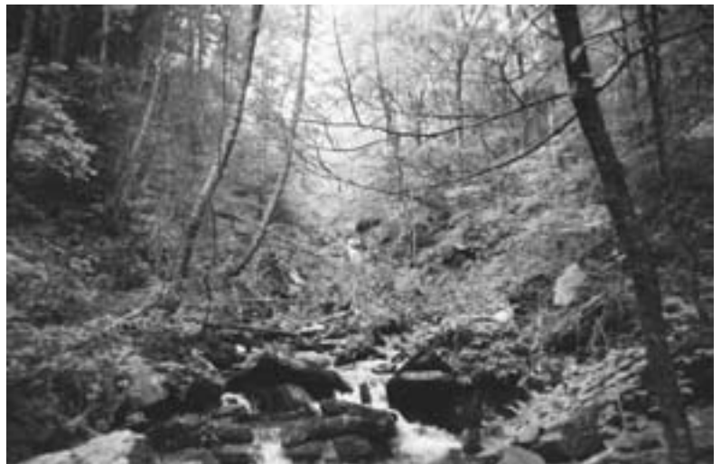
More of Roaring Run in western Franklin County will be permanently conserved with a new riparian easement.