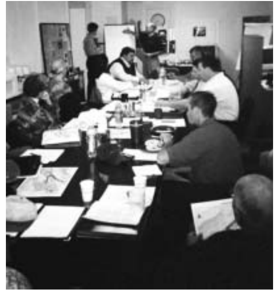
Brainstorming session at the first meeting of the Carvins Cove Task Force.

WVLT is forming a working partnership with local governments, state and federal agencies, non-profits and landowners that seems primed to accomplish its ambitious conservation goal. Membership of the task force is still being expanded. Look for a full list of participants and an update on this exciting initiative in the next issue of Land Protection News .