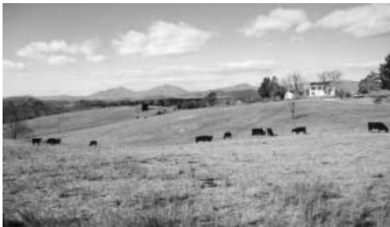
The Fellers homeplace with Peaks of Otter in the distance.

Newest Bedford County Easement Preserves 256 Acres