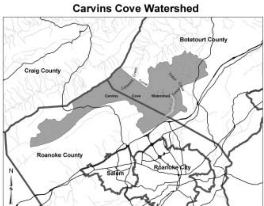
Map courtesy of Roanoke Valley-Allegheny Regional Commission.