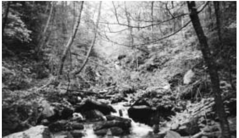
This section of Franklin County's Roaring Run – a native trout stream – will be preserved through a WVLT riparian easement. The surrounding property of 125 acres is also being placed in a conservation easement to protect views from the nearby Smart View Overlook on the Blue Ridge Parkway.

Starting in 2000, the Land Trust was awarded a series of WQIA grants from the Virginia Department of Conservation and Recreation. The grants fund the purchase of riparian easements to protect water quality. Landowners can receive up to $950 per acre to retain tree cover (or allow it to grow back) to filter and slow runoff before it enters the water. Stream corridors in permanent plant cover also help prevent erosion and provide shade to enhance fish habitat.