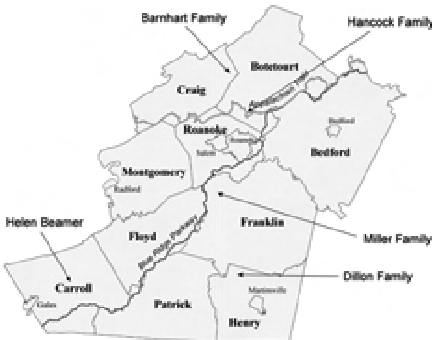
Landowners featured in this issue.

Conservation easements can be used to accomplish these goals by limiting intensive development while keeping land in private hands and providing landowners with substantial tax benefits and even cash compensation. A conservation easement is a flexible and voluntary tool that lets you determine the legacy of your land. After reading this magazine, if a conservation easement seems like a natural fit for you, or if you just need more information to see if one might work for you, please call us at (540) 985-0000 or check out our website at westernvirginalandtrust.org . You can also attend one of the free evening landowner workshops in your area—see the schedule of events on page 7 or the back cover. ☎