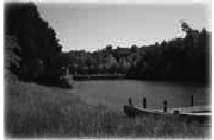
The Dillon family has a small pond and cabin on their Henry County land.

houses can be built there. Western Virginia Land Trust staff met with Hiram Dillon in early 2009 and put him in touch with VOF to draw up and hold their easement.